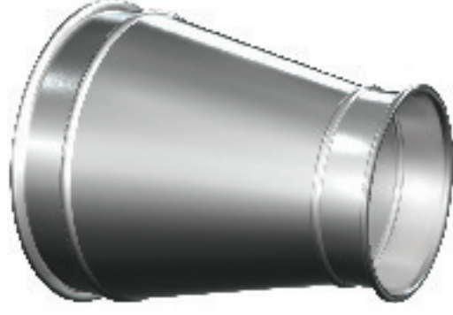
L = (\emptyset - \emptyset_A) + 166mm