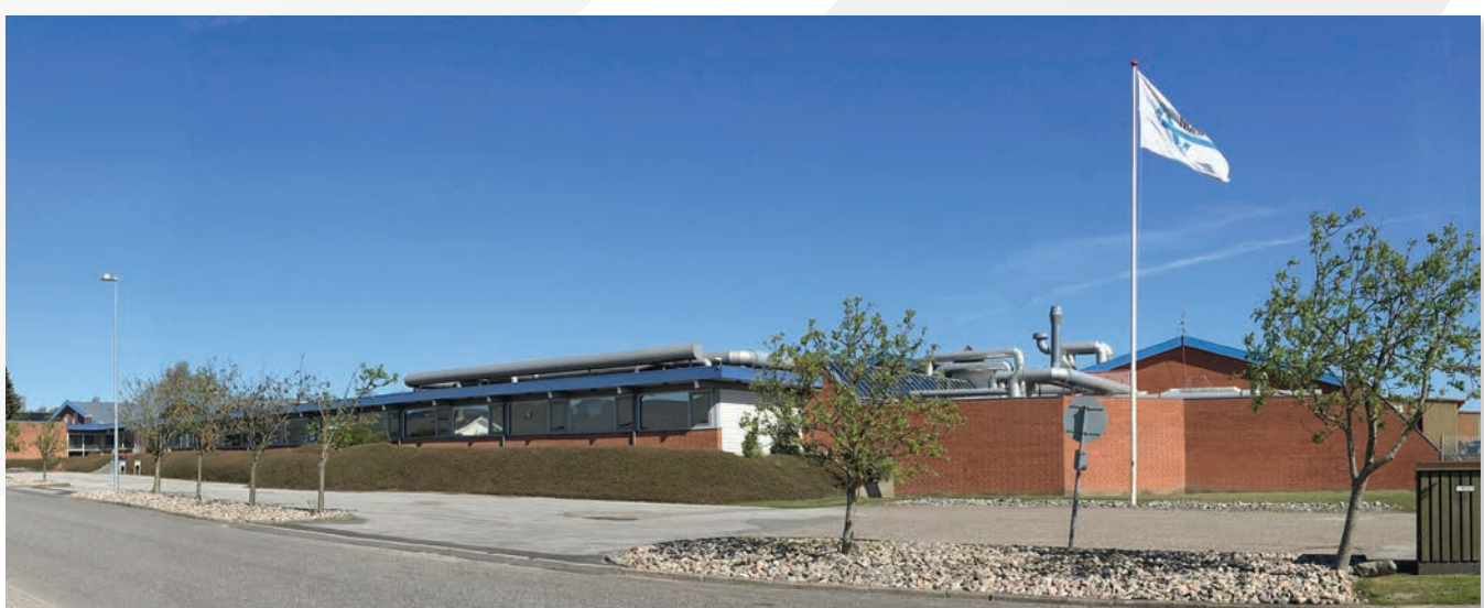
Nordfab Europe A/S sales and production in Assen Mariager, Denmark