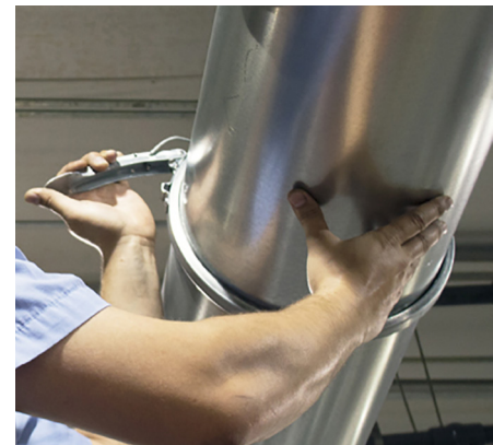
QF Pipe is quickly and easily clamped together.