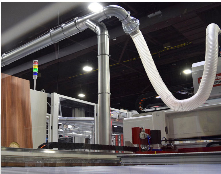
Above: A QF Ball Joint is shown in a QF duct line installed on woodworking machinery. Nordfab provides a full range of rubber hoses.