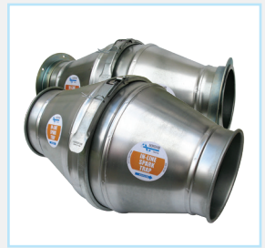
Not an explosion isolation device