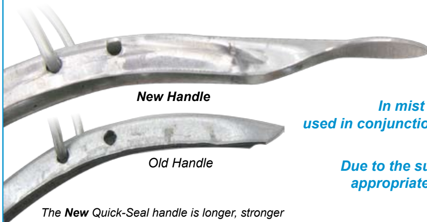
The New Quick-Seal handle is longer, stronger and provides a better grip

Due to the super-tight fit of the Quick-Seal clamp, Q-F is appropriate for low pressure positive transfer systems